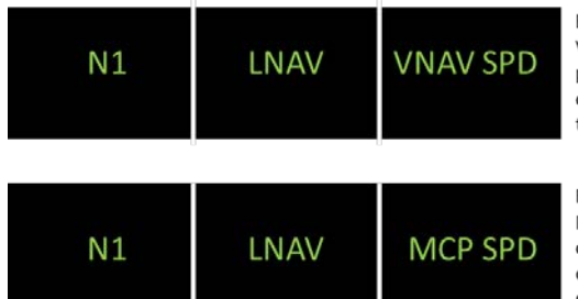
Figure 2: Relevant example FMA annunciations (VNAV upper example and LVL CHG lower example)

Example of FMA annunciations during a climb in VNAV mode . In this case, VNAV SPD indicates that the auto-flight system is following the FMC-programmed speed profile. N1 indicates that the auto-throttle system is commanding a set engine speed limit and LNAV (lateral navigation) indicates that the auto-flight system is following a programmed lateral track.